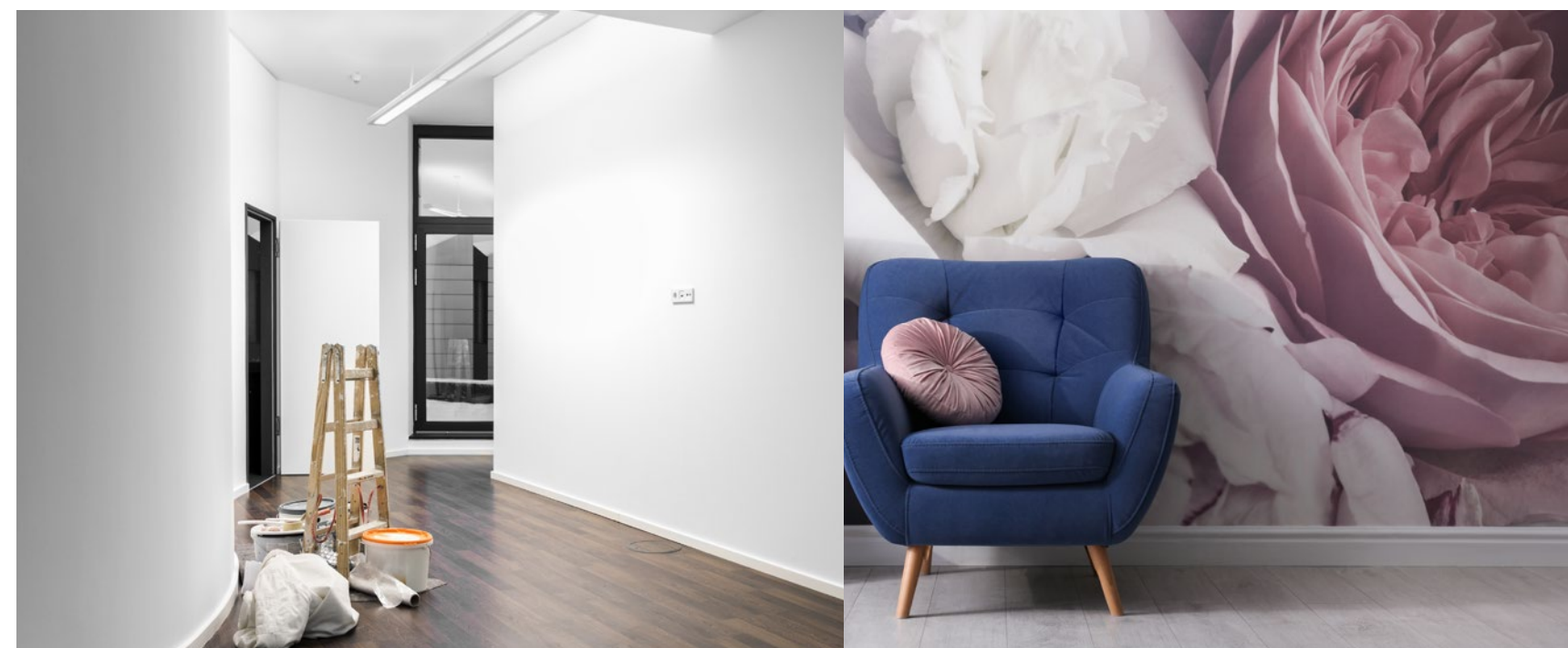
SMOOTH NONWOVENS AND WALLCOVERINGS